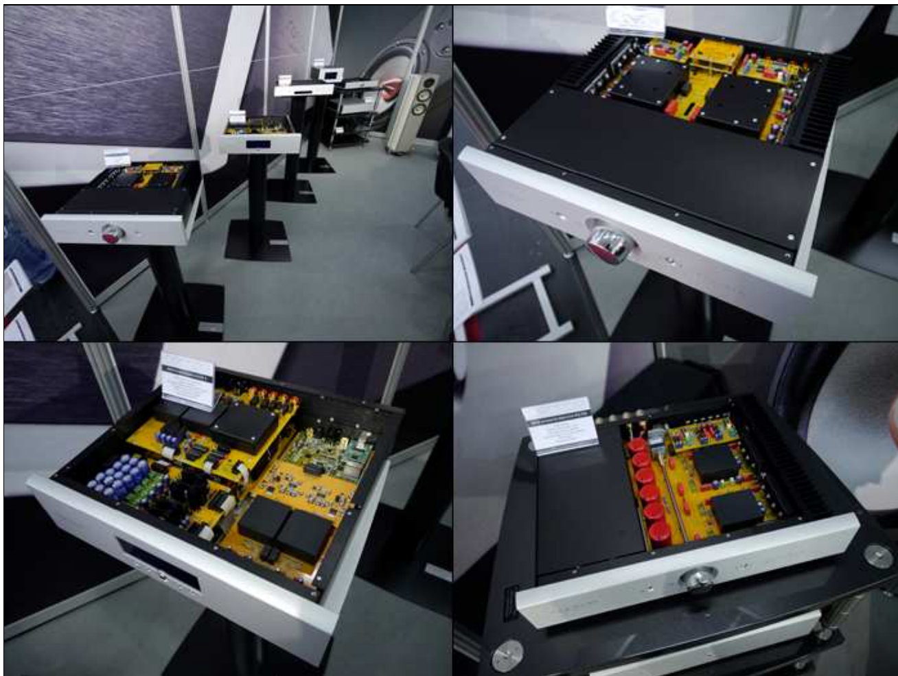
Norma at Munich HighEnd 2013